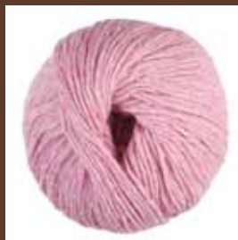
CA13 Sweet Pea